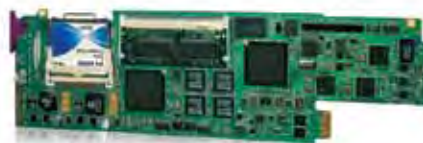
Miranda Densité HMP-1801 single card, solid-state media server