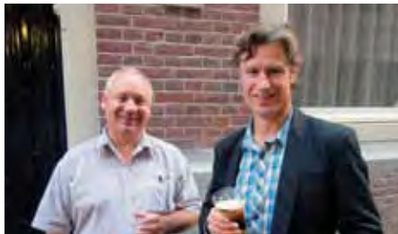
Magna Systems' IBC 2011 dinner