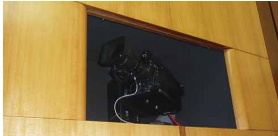
Magna Systems' installation of the new Camera Robotic Control Solution at Australia's Parliament House.

The Cambotics 600PTZ robotic head is available as a stand-alone product for post, tripod mounting, or with an elevation column. Its 57kg capacity easily carries today's typical studio configurations with teleprompters and preview monitors. The elevation column adds extremely smooth on-air quality vertical moves to the production. The Cambotics 600PTZ robotic head has a top pan/tilt speed of 90 degrees per second and a top elevation speed of 12.7 cm per second.