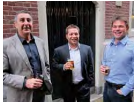
Magna Systems' IBC 2011 dinner