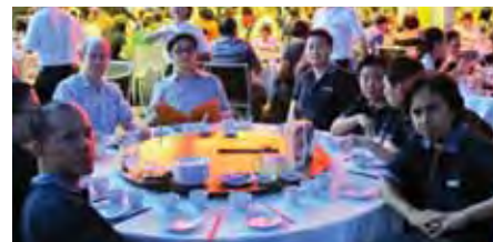
Singapore office team

Many congratulations to all of our hard working staff in Singapore and many thanks to all of our loyal clients in the region without whom none of our success would have been possible.