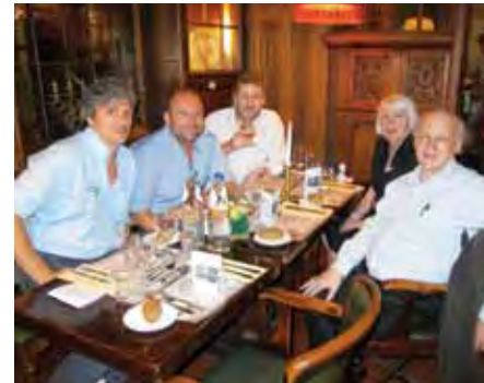
Magna Systems' IBC 2011 dinner