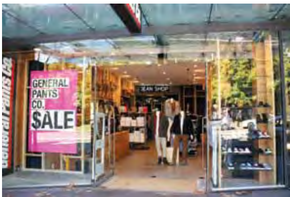
General Pants Store Paddington

Competitively priced, these beautifully designed loudspeakers incorporate a 4" polypropylene weather resistant woofer and a 19mm neodymium dome tweeter, a single 4" with the ARCO-4 and a 2 X 4" with the ARCO-24.