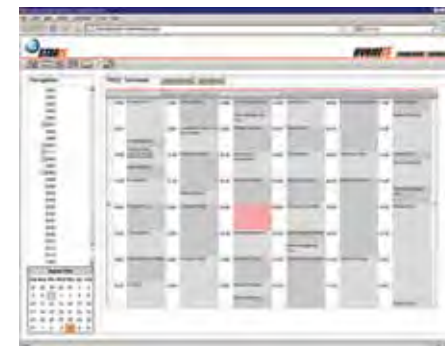
StagIS screen shot

The STAGIS product extracts and aggregates into a central database schedule data (EIT) and service descriptions (SDT) from the incoming streams provided by the broadcasters involved, Optus customers. The extracted data is then re-used and re-organised by the CASIS product to generate the DVB-SI tables and descriptors for the VAST platform. These tables and descriptors allow the VAST receivers to find their programmes, display service information like channel names and numbers, local time, and most of all, to populate the