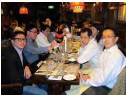
Magna Systems' IBC 2011 dinner