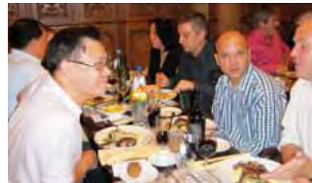
Magna Systems' IBC 2011 dinner