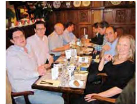
Magna Systems' IBC 2011 dinner