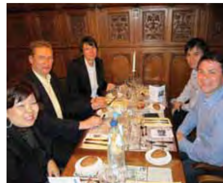
Magna Systems' IBC 2011 dinner