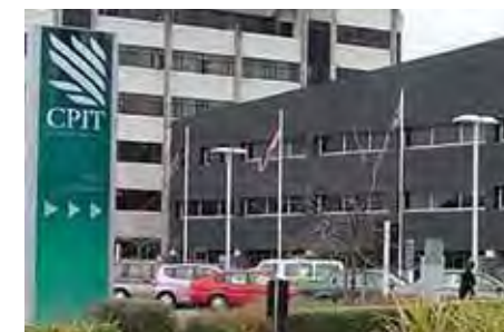
New Zealand Broadcasting School

After consulting with Brewer and the Magna NZ team the NZBS purchased