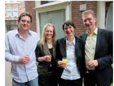
Magna Systems' IBC 2011 dinner