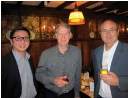
Magna Systems' IBC 2011 dinner