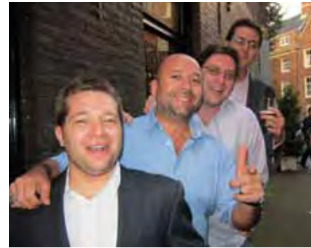
Magna Systems' IBC 2011 dinner