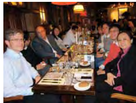
Magna Systems' IBC 2011 dinner