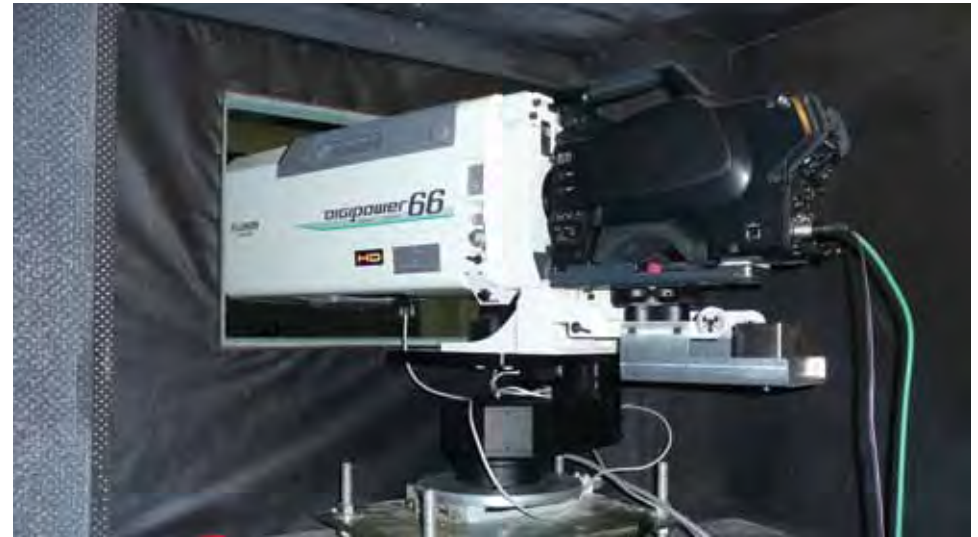
Magna Systems' installation of the new Camera Robotic Control Solution at Australia's Parliament House.